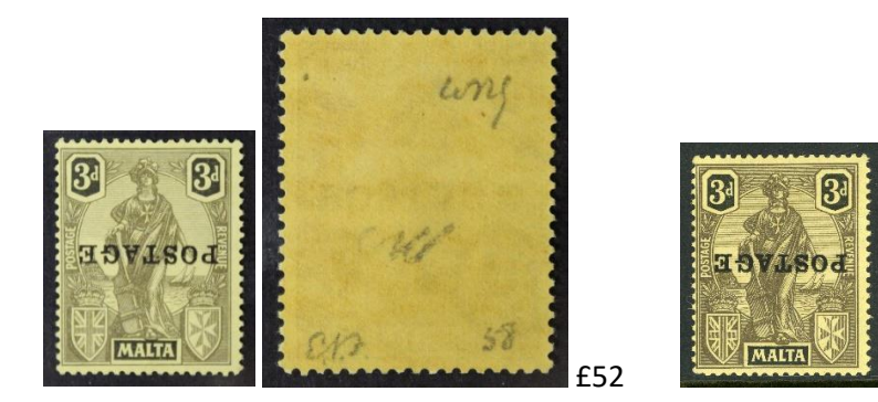
Number Copy – No. 58

No number but new signature ?.. Dealers Mark ?