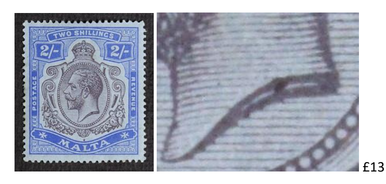
New plate flaw ?.. 'Flaw at base of neck' ?