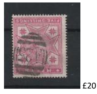
Watermark Inverted (cheap!)