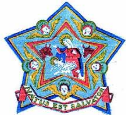
== First Day Cover == (6)