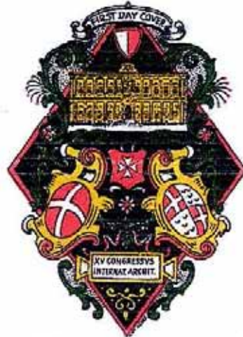
12th September 1967 (5)